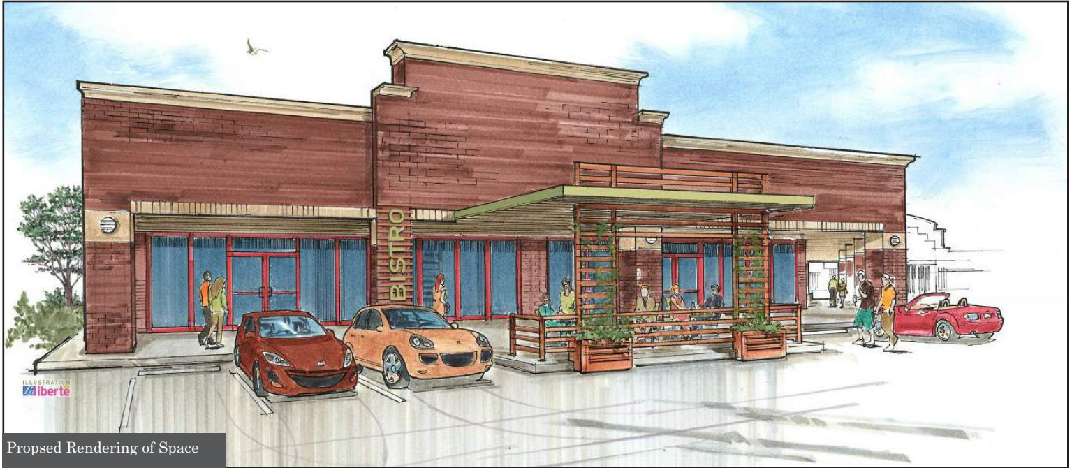
Proposed Rendering of Space

Depot Marketplace is looking to accommodate a unique indoor/outdoor restaurant in a prime end-cap space!