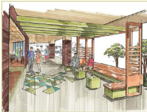
Proposed Rendering of Space