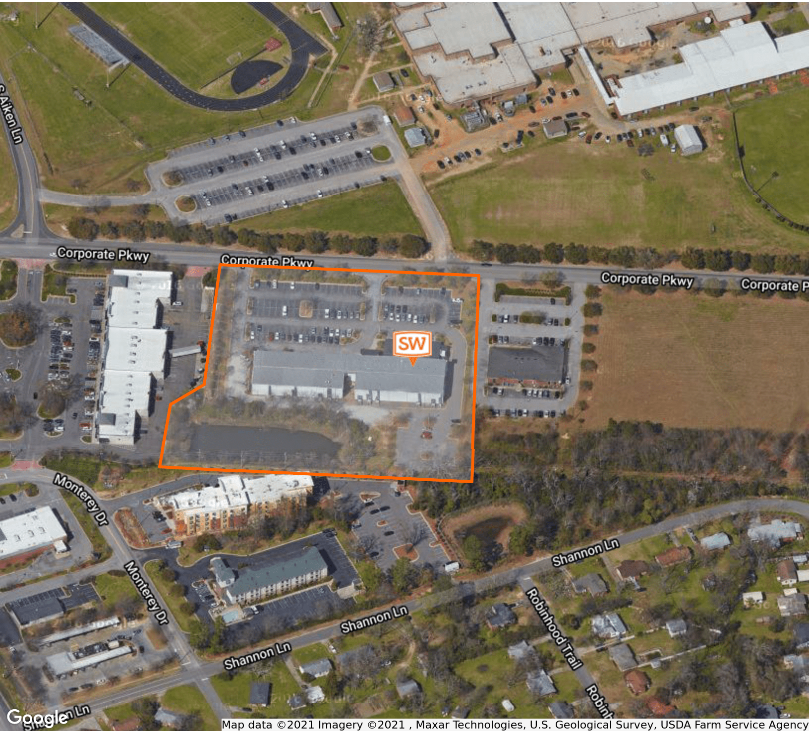
Map data ©2021 Imagery ©2021 , Maxar Technologies, U.S. Geological Survey, USDA Farm Service Agency