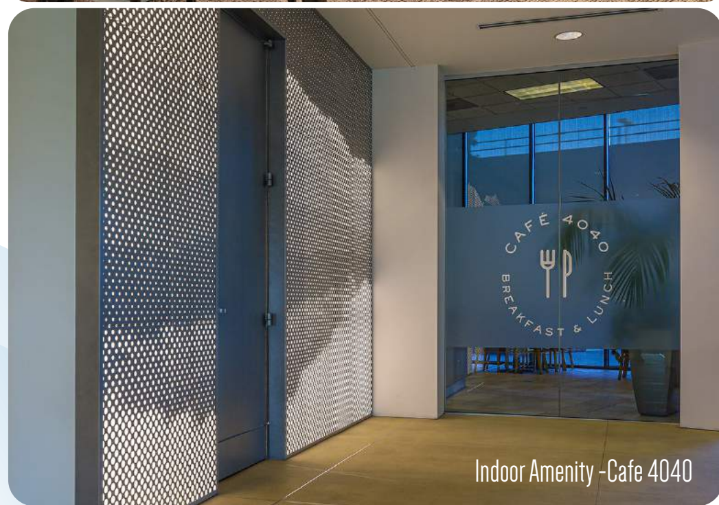
Indoor Amenity - Cafe 4040