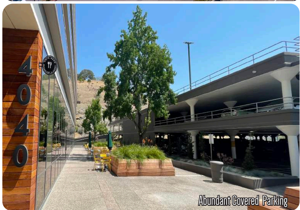
Abundant Covered Parking

LOCATION, QUALITY, ENVIRONMENT, CONVENIENCE.