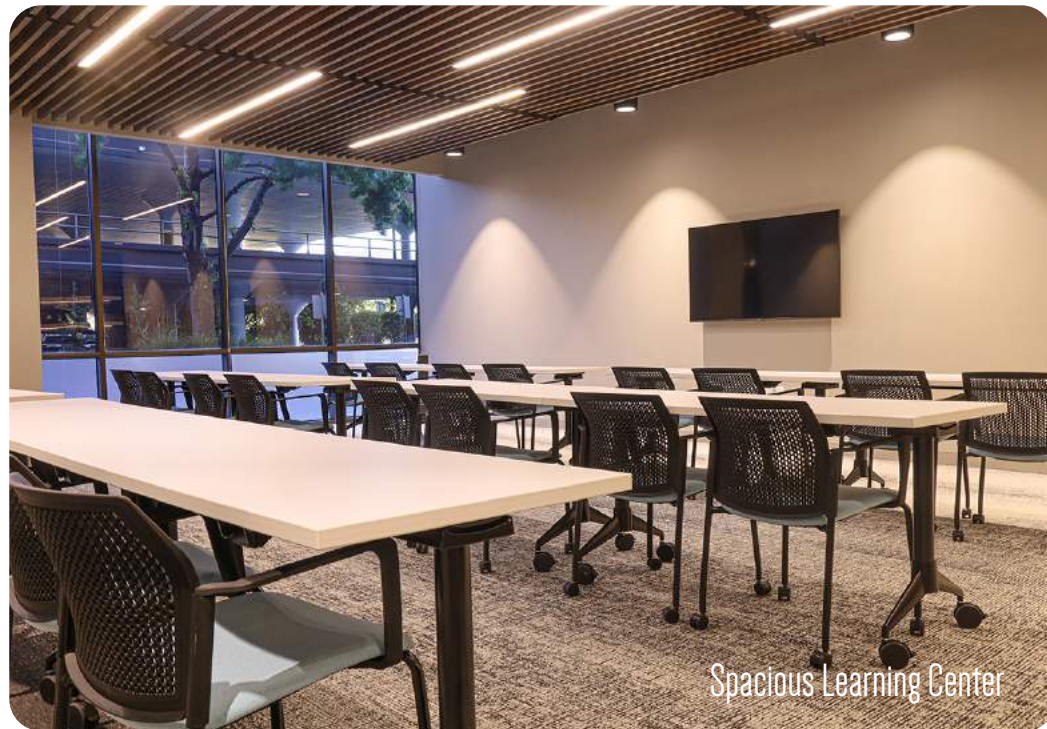
Spacious Learning Center