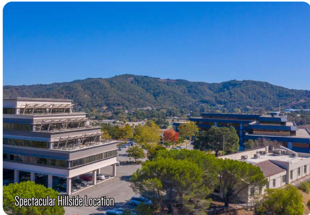
Spectacular Hillside Location