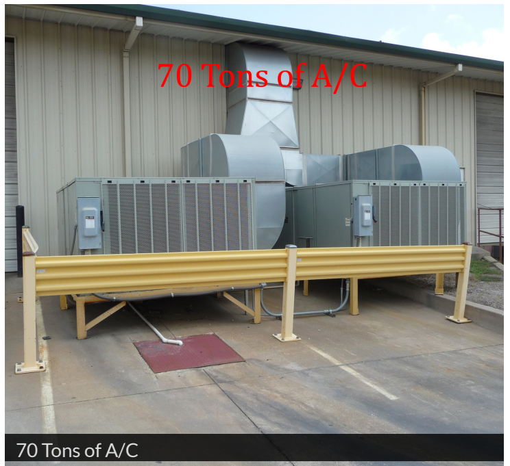
70 Tons of A/C