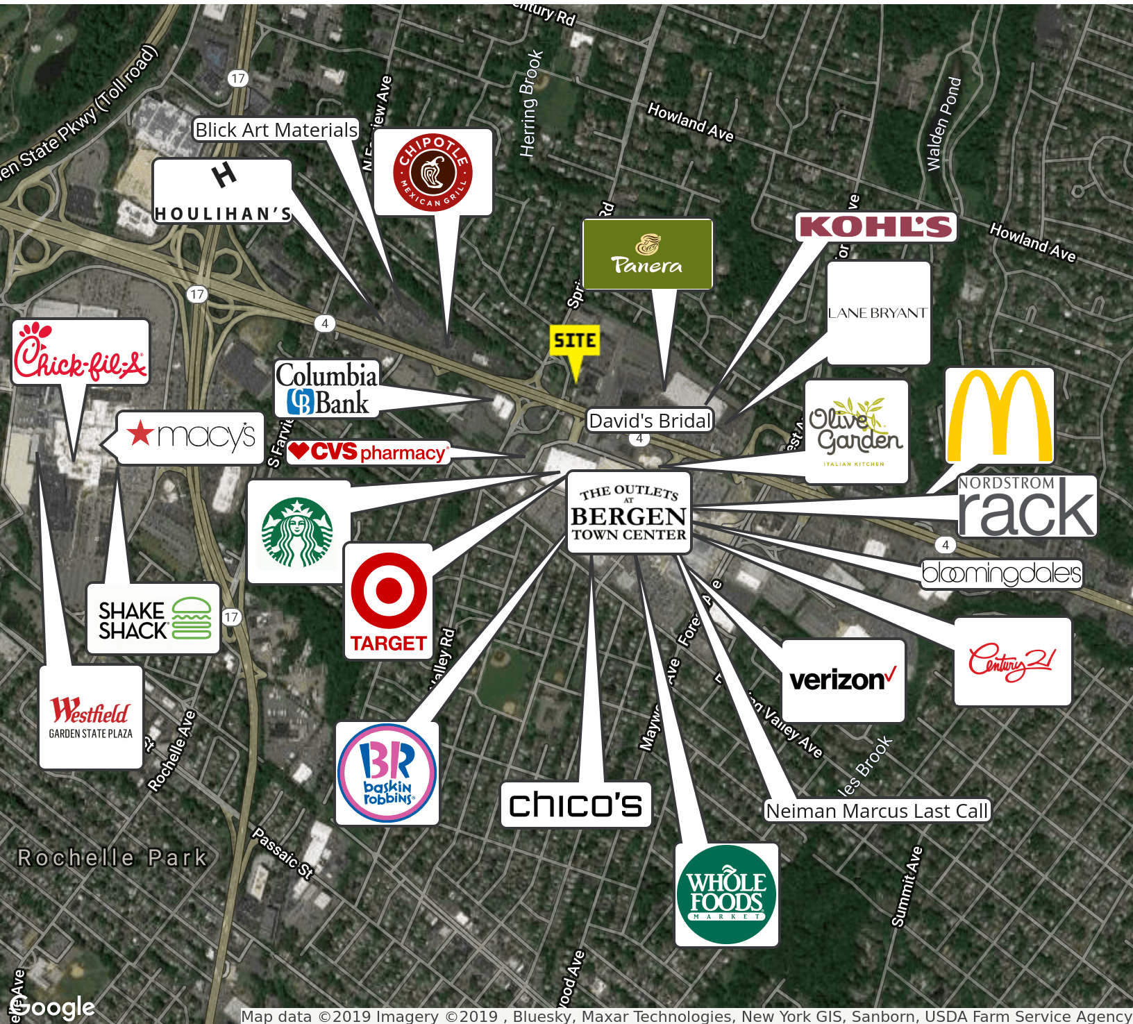
Map data © 2019 Imagery © 2019, Bluesky, Maxar Technologies, New York GIS, Sanborn, USDA Farm Service Agency