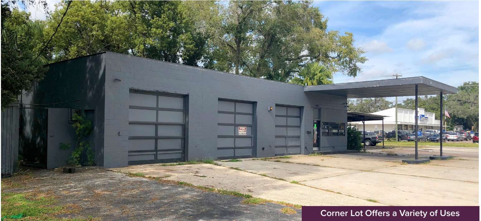
Corner Lot Offers a Variety of Uses

BERKSHIRE HATHAWAY HomeServices Florida Properties Group COMMERCIAL DIVISION