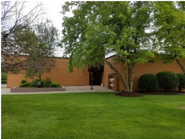
26771 W 12 Mile Exterior 1