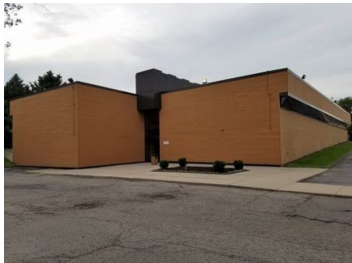
26771 W 12 Mile Exterior 3