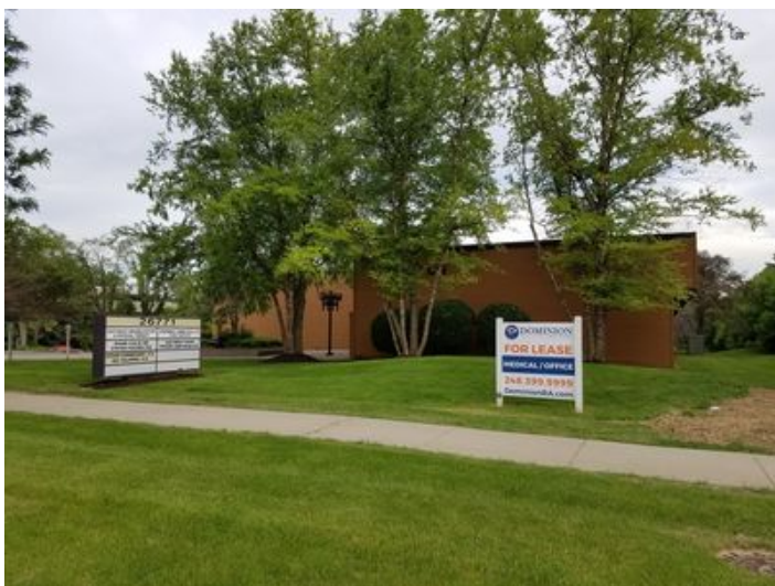
26771 W 12 Mile Exterior 2