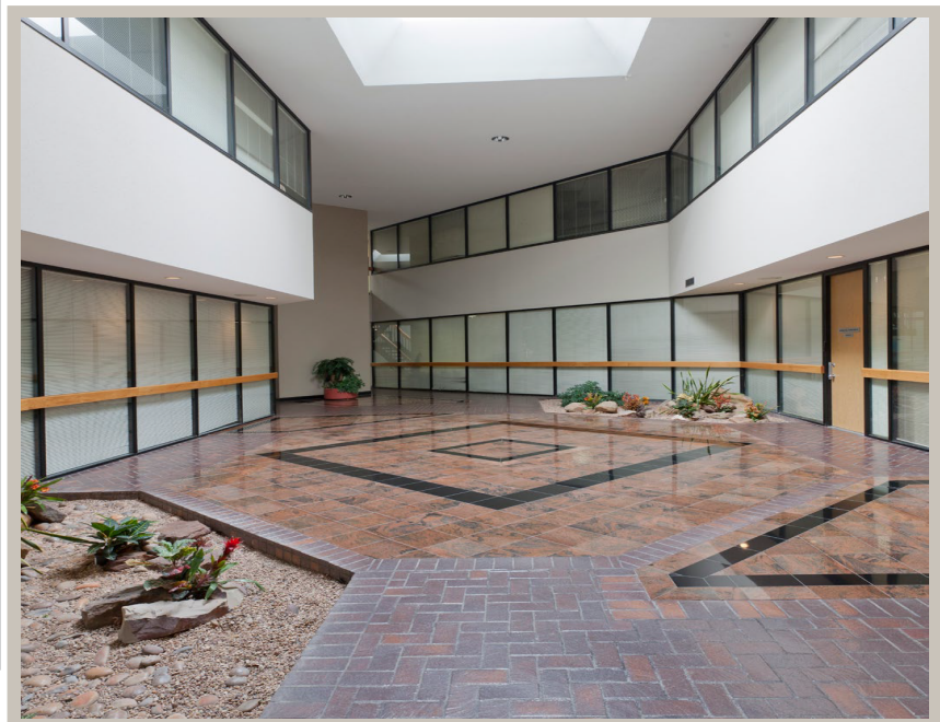
MAIN LOBBY AREA OF THE BUILDING