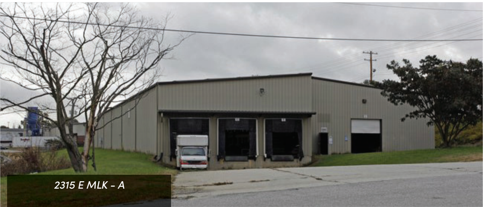
2315 E MLK - A