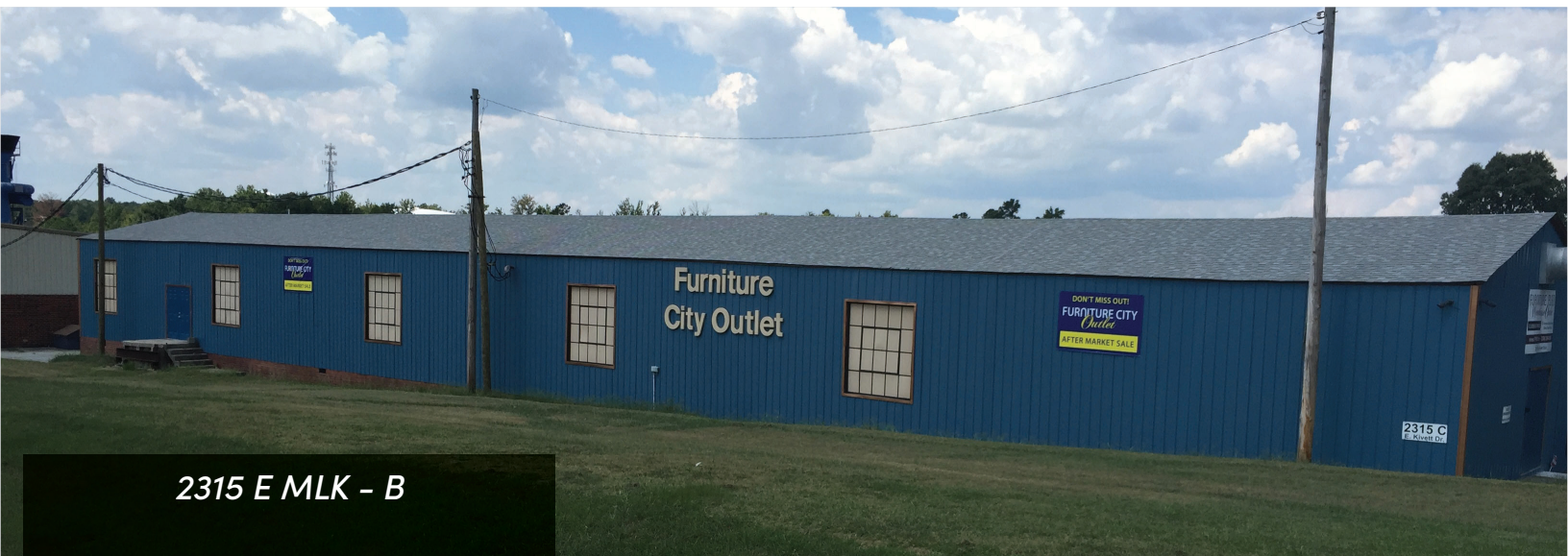
2315 E MLK - B