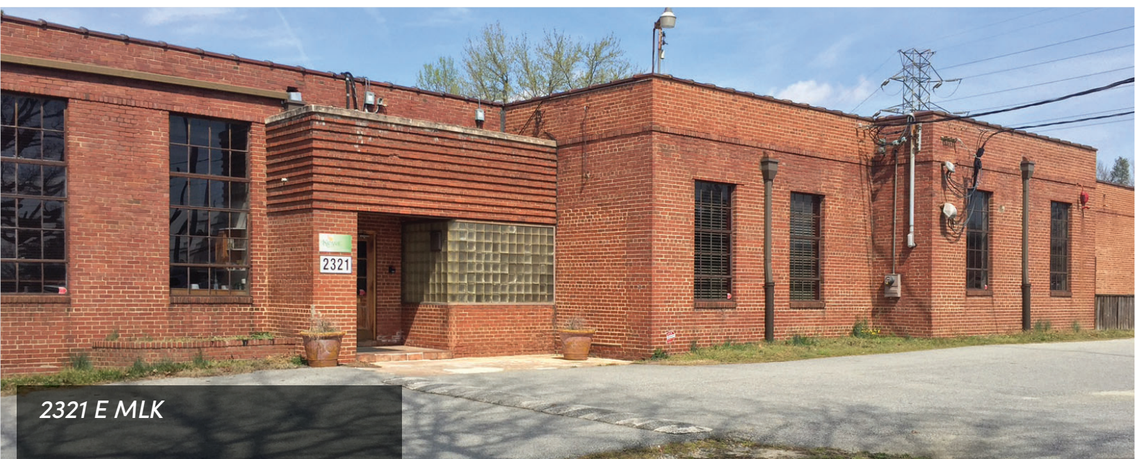
2321 E MLK