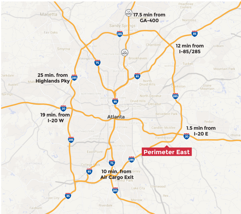
Information is deemed from reliable sources. No warranty is made as to its accuracy.

LESS DEVELOPED CENSUS TRACT Equivalent Benefits of Opportunity Zone