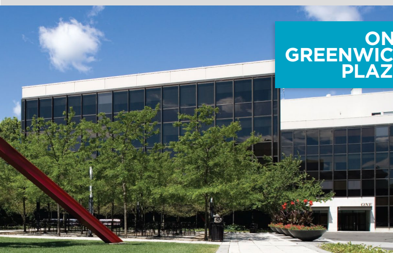
ONE GREENWICH PLAZA