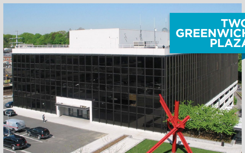
TWO GREENWICH PLAZA

ENTIRE FIRST FLOOR: 41,038 RSF AVAILABLE