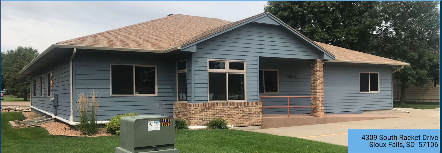
4309 South Racket Drive Sioux Falls, SD 57106