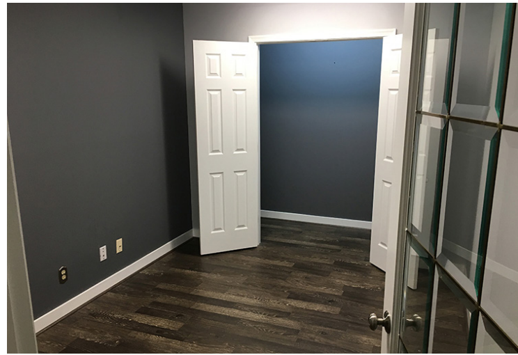
11614 Busy Street