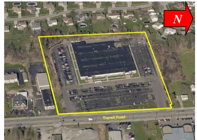
Tax Map / Aerial