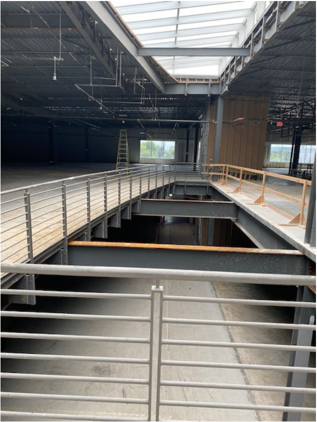
Dramatic atrium skylight