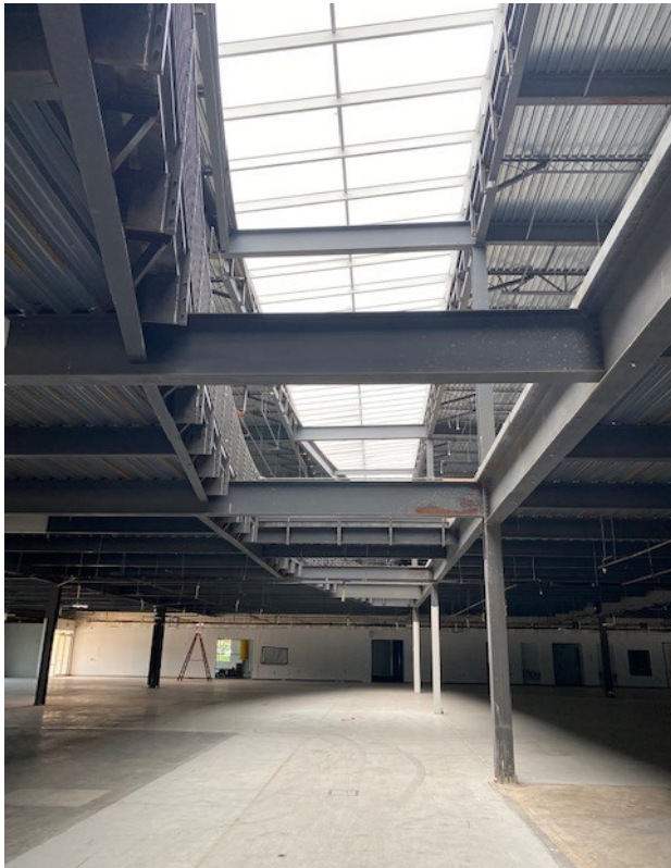
Second floor open to skylights