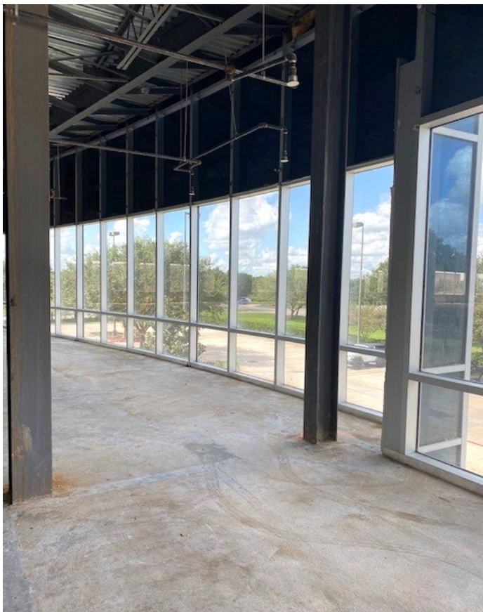
Full-height glass at front of the building