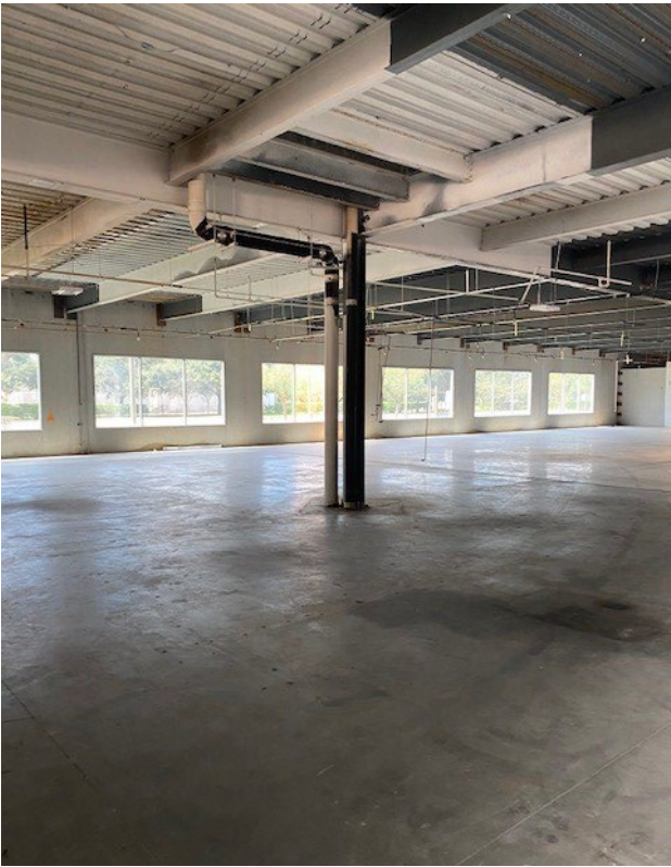
Slab condition allows users to customize the space