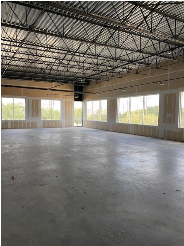
Oversized windows throughout