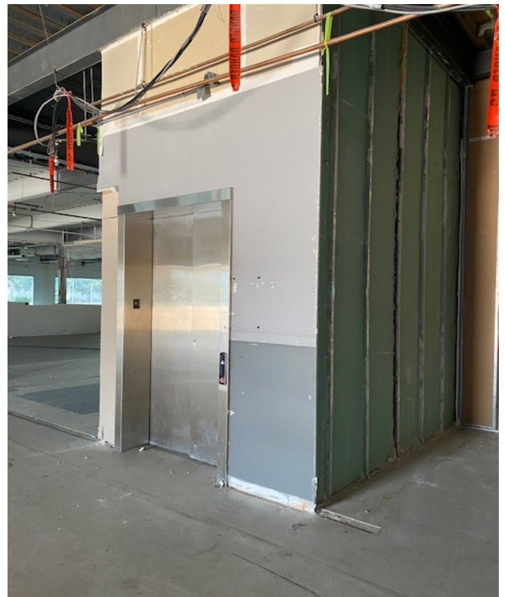
Elevators at both ends of the building