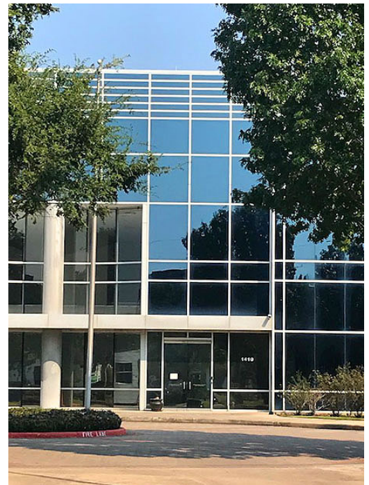
Dramatic glass curtain wall at entry