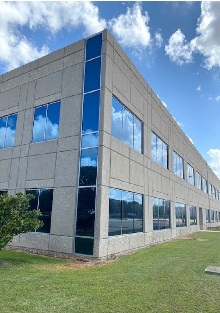
Concrete panels with attractive window detail