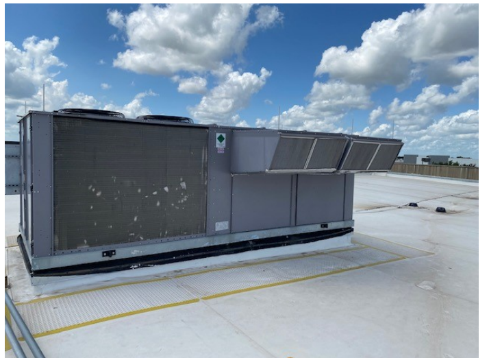
Two 50-ton rooftop units added