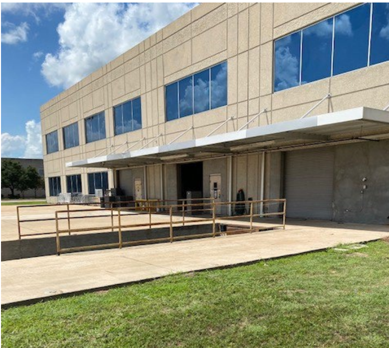
Grade-level and dock-high delivery capabilities