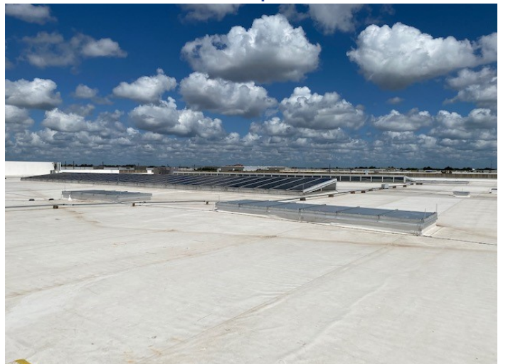
New TPO roof