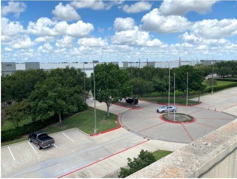
Circular drive at front entry