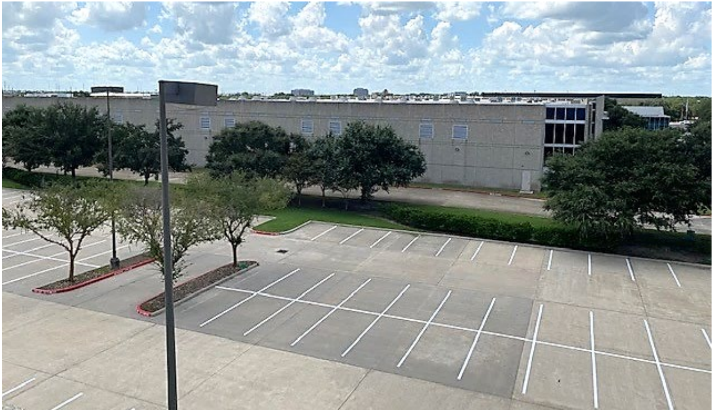
Above-standard ratio of surface parking on a 10.65-acre site