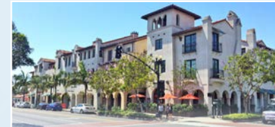
Paseo Chapala Commercial/Retail Condo ±923 SF