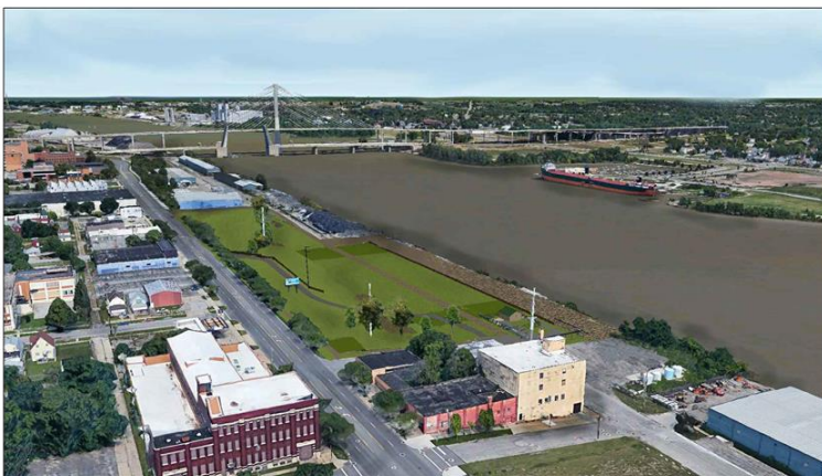
View looking east