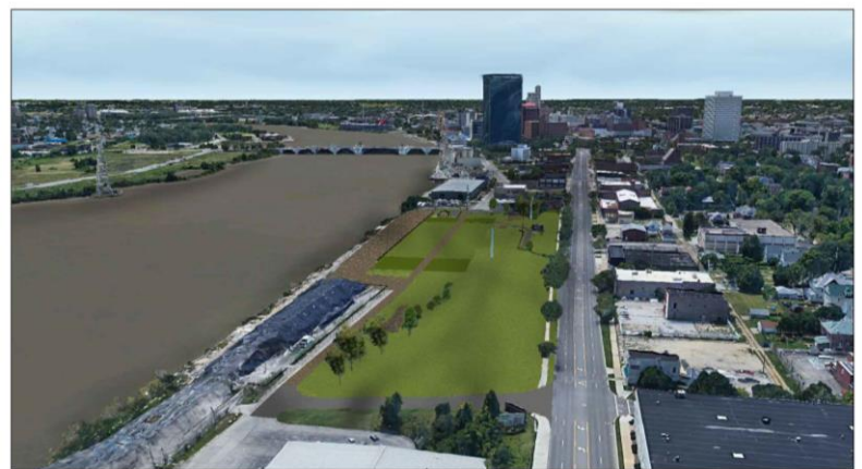
View looking west