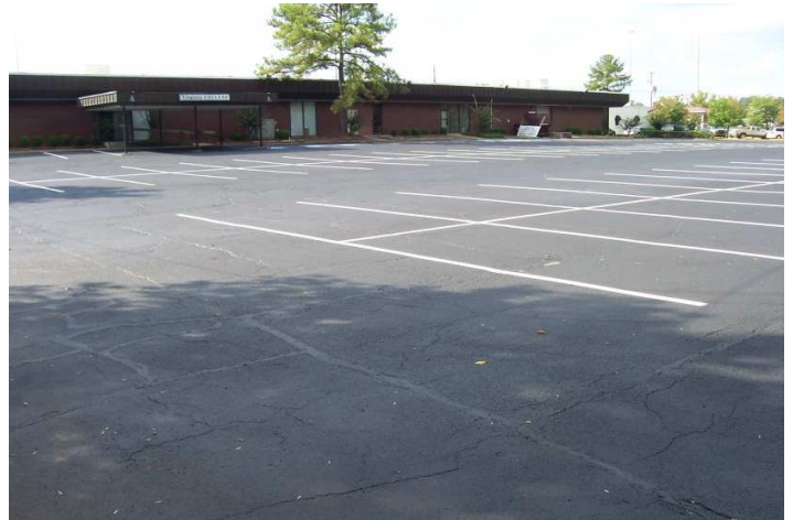
Parking lot and back of building