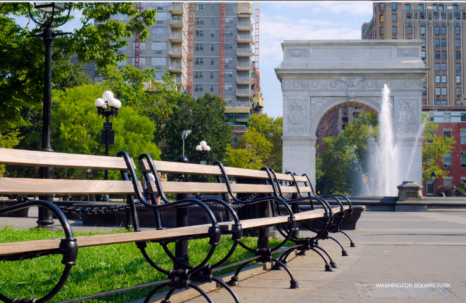
WASHINGTON SQUARE PARK