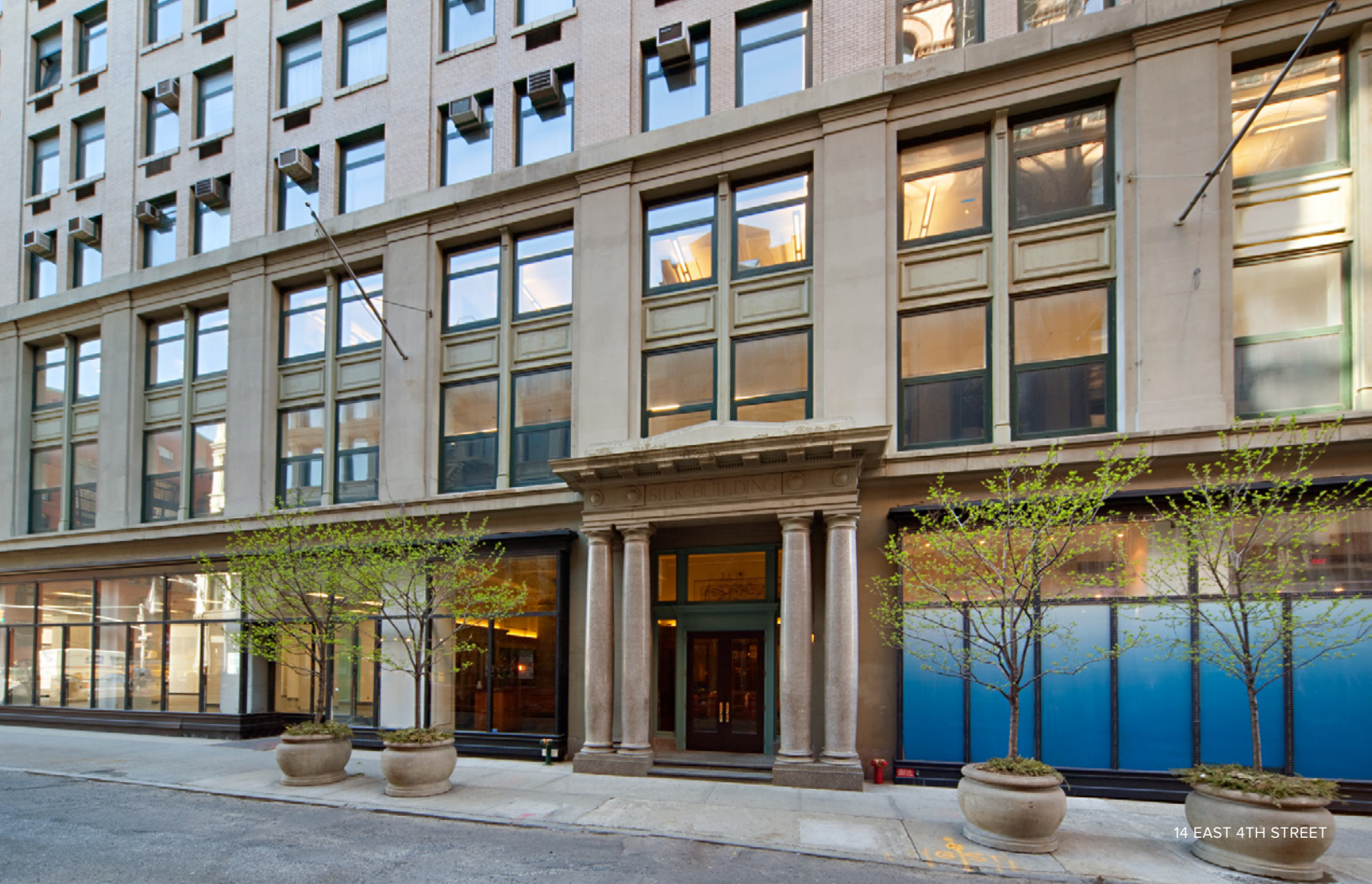
14 EAST 4TH STREET