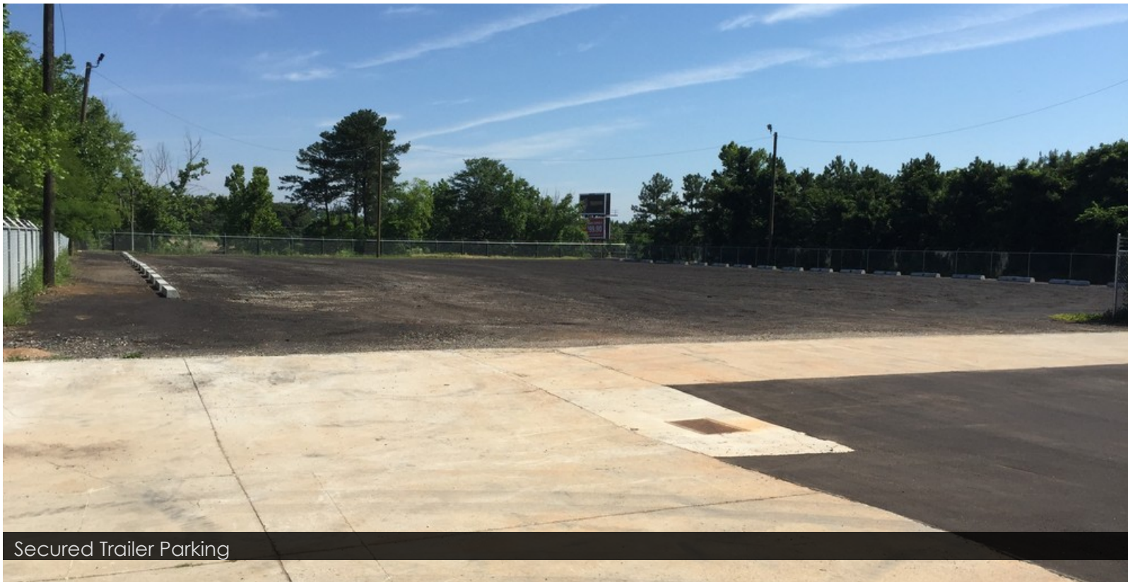
Secured Trailer Parking