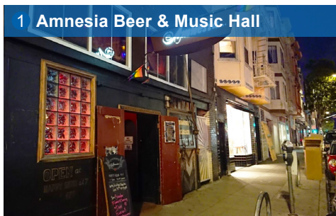
1 Amnesia Beer & Music Hall