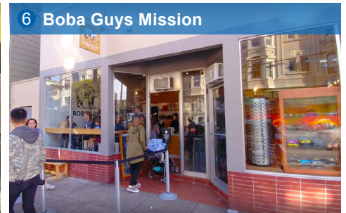
6 Boba Guys Mission