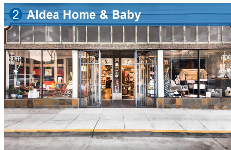
2 Aldea Home & Baby