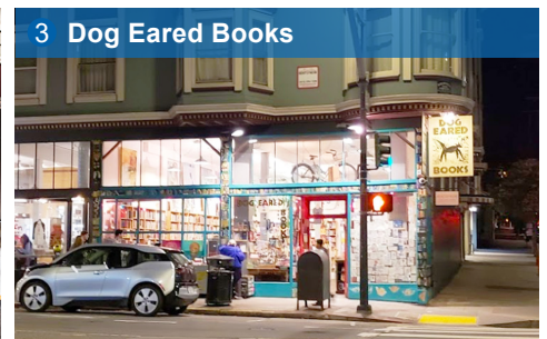
3 Dog Eared Books