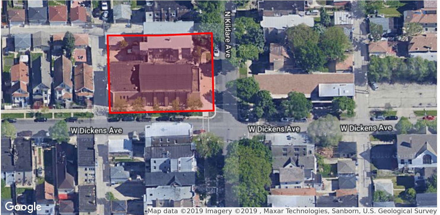
Map data ©2019 Imagery ©2019, Maxar Technologies, Sanborn, U.S. Geological Survey