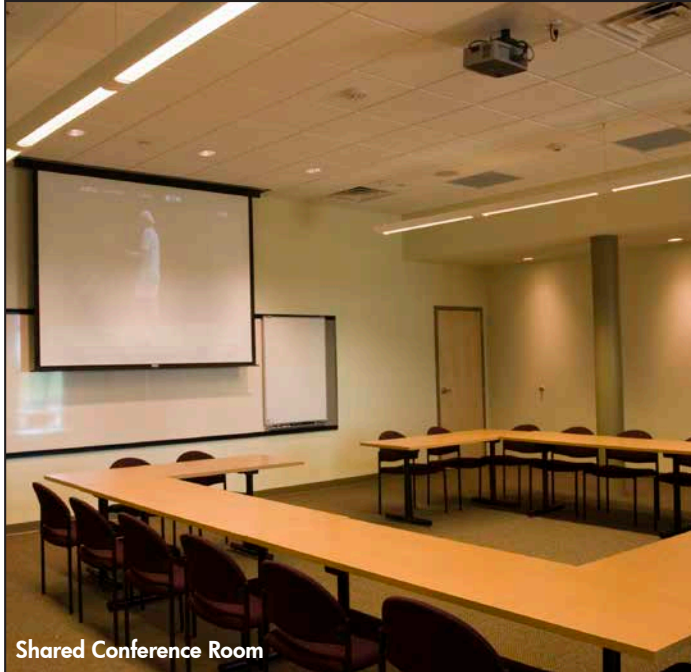
Shared Conference Room