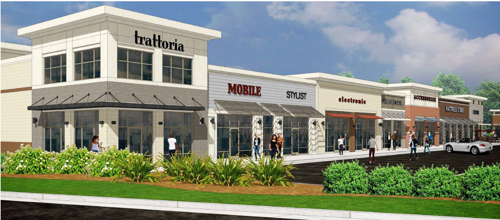
Harbour View Place (Phase II) | Harbour View Blvd., Suffolk, Virginia