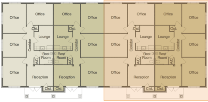
Suites 603 & 604 2,450 SF Available