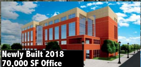
Newly Built 2018 70,000 SF Office