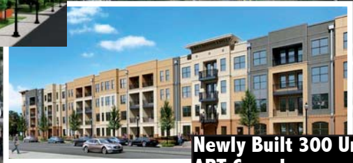
Newly Built 300 Unit APT Complex

Still Waters EST. & MANAGED BY Garden St Fabric & Design