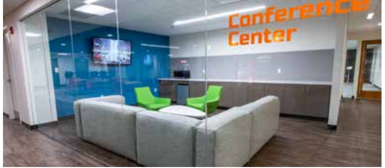
NEW AMENITIES CENTER