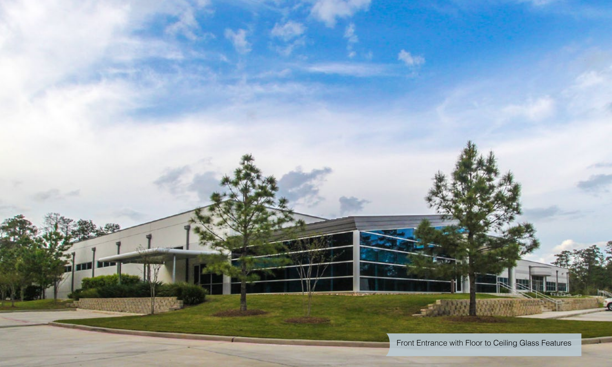
Front Entrance with Floor to Ceiling Glass Features