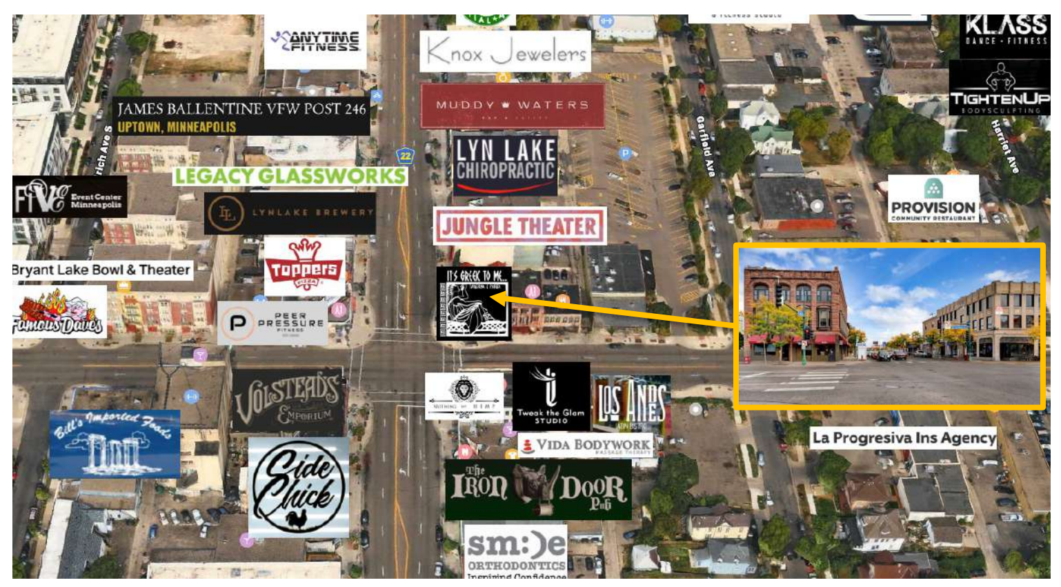
This information is accurate as of the date of printing and is subject to change without notice. All information is deemed accurate, but cannot be guaranteed.