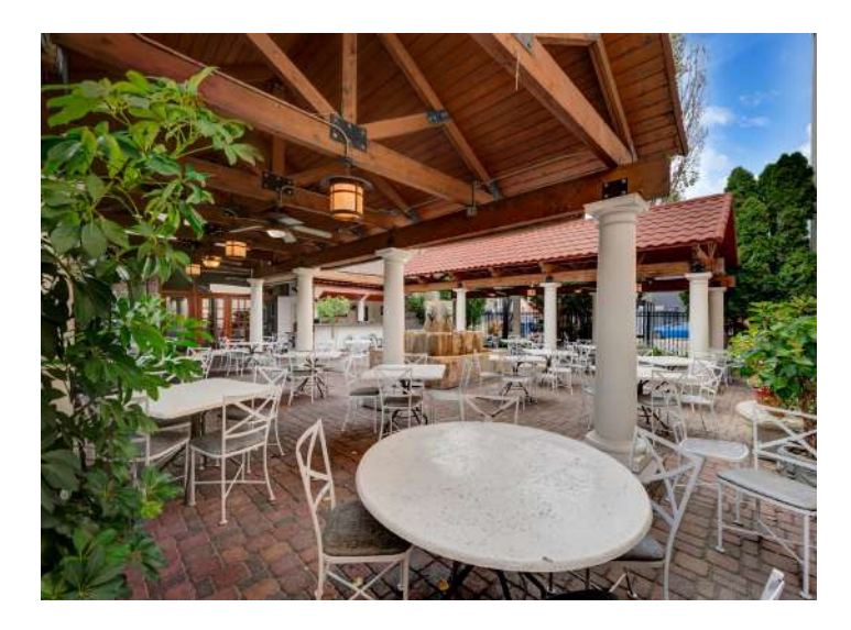
This information is accurate as of the date of printing and is subject to change without notice. All information is deemed accurate, but cannot be guaranteed.