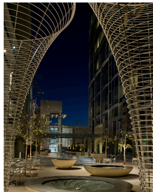
All images used with permission. ©2009 Cameron Carothers Photography.

HUNT BARNETT Principal (310) 407-3424 hbarnett@larealtypartners.com