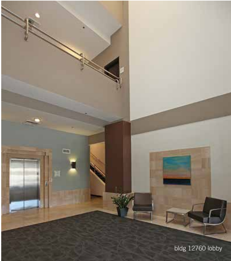
bldg 12760 lobby