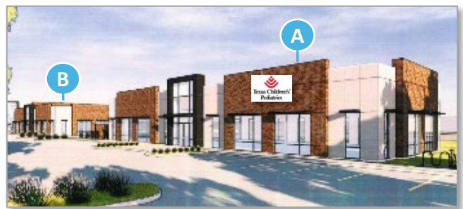
BUILDING A - Texas Children's Hospital BUILDING B - 7,026 SF Available