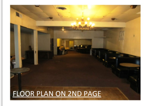
FLOOR PLAN ON 2ND PAGE