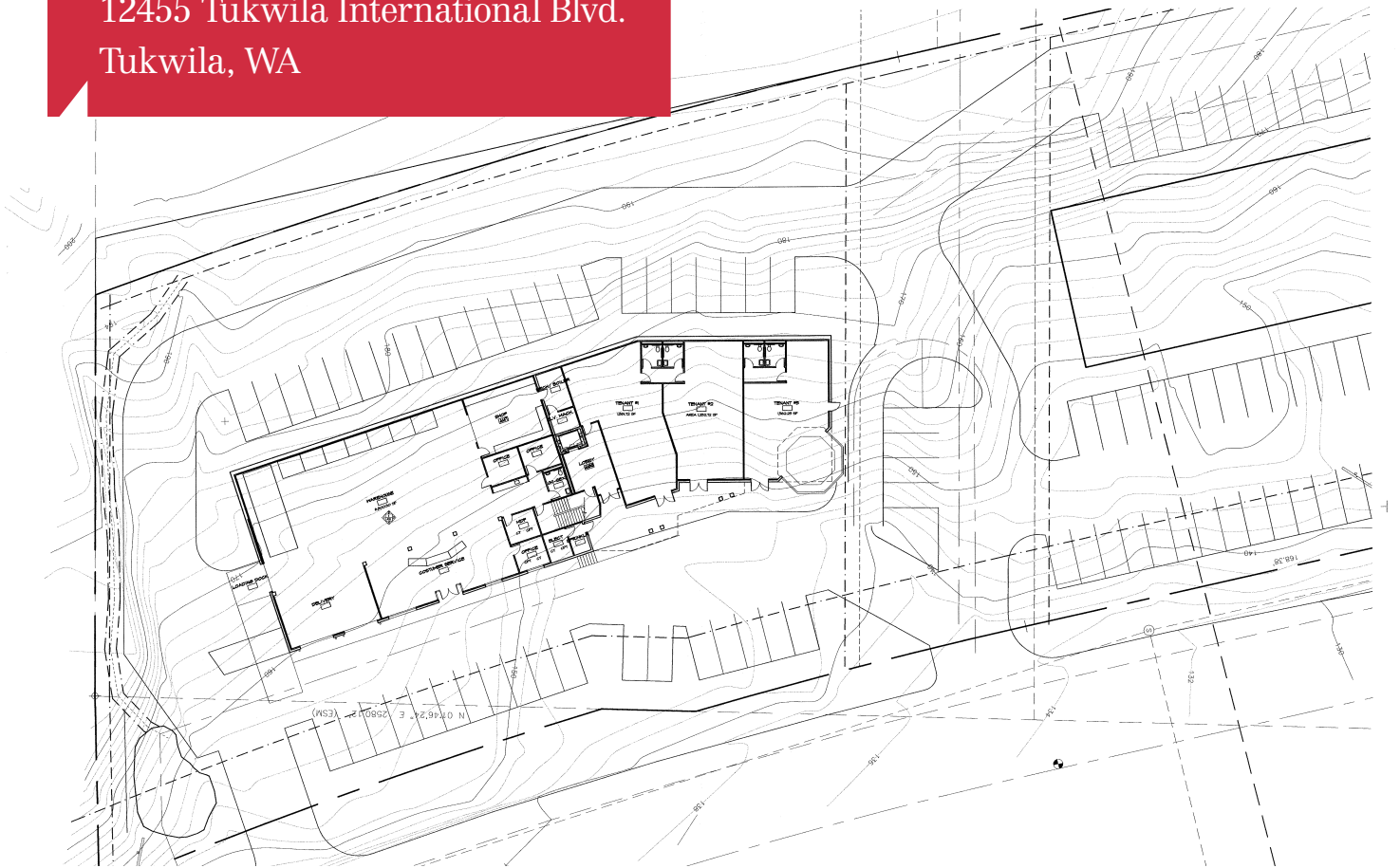
Conceptual Plan For Parcel #3

12455 Tukwila International Blvd. Tukwila, WA