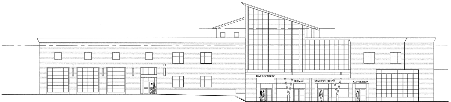
Conceptual Elevation View