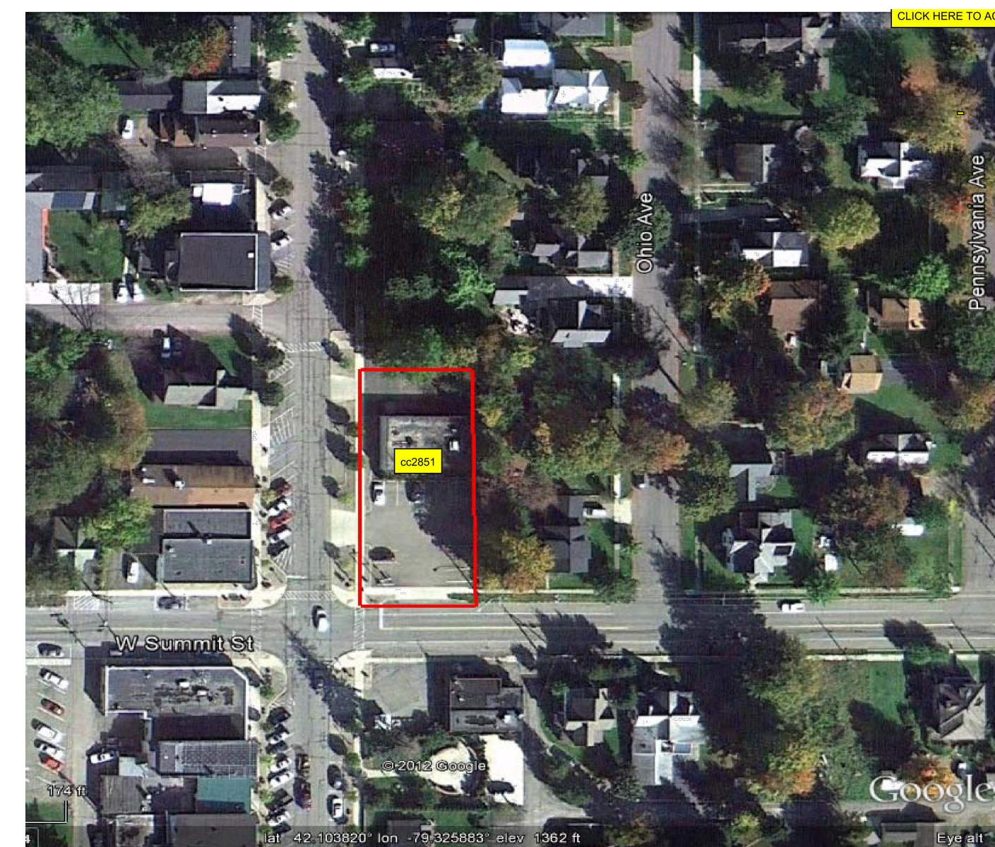
SITE PLAN NTS

Special Information: THIS DRAWING PREPARED FOR TENANT IMPROVEMENTS TO AN EXISTING BUILDING OR BUILDING CONSTRUCTED BY OTHERS IT IS UNDERSTOOD THAT ANY WARRANTY INFORMATION CONCERNING EQUIPMENT INSTALLED MUST BE FORWARDED TO THE OWNER AND THAT ANY AND ALL CONTRACTORS SHALL GUARANTEE THEIR WORK FOR A PERIOD OF ONE YEAR FROM THE DATE OF OWNERS ACCEPTANCE.