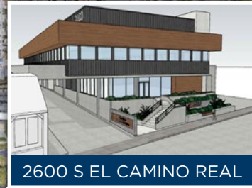
2600 S EL CAMINO REAL