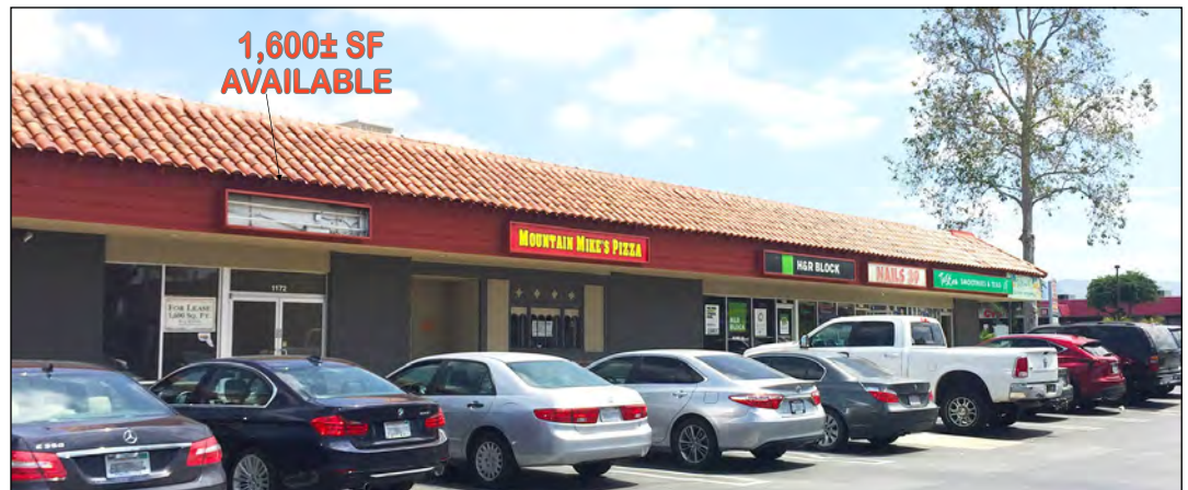
Building "C" 881± SF—1,600± SF Suite Available (Additional Available Units Not Pictured)

MEACHAM/OPPENHEIMER, INC. COMMERCIAL BROKERAGE INVESTMENT SALES 8 No. San Pedro St., Suite 300 San Jose, California 95110 Tel: 408.378.5900 www.moinc.net