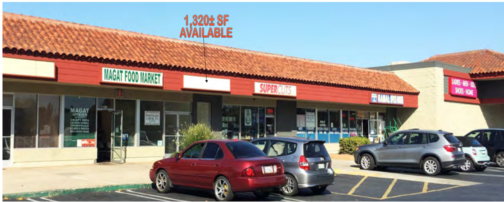
Building "A" with 1,320± SF Suite Available