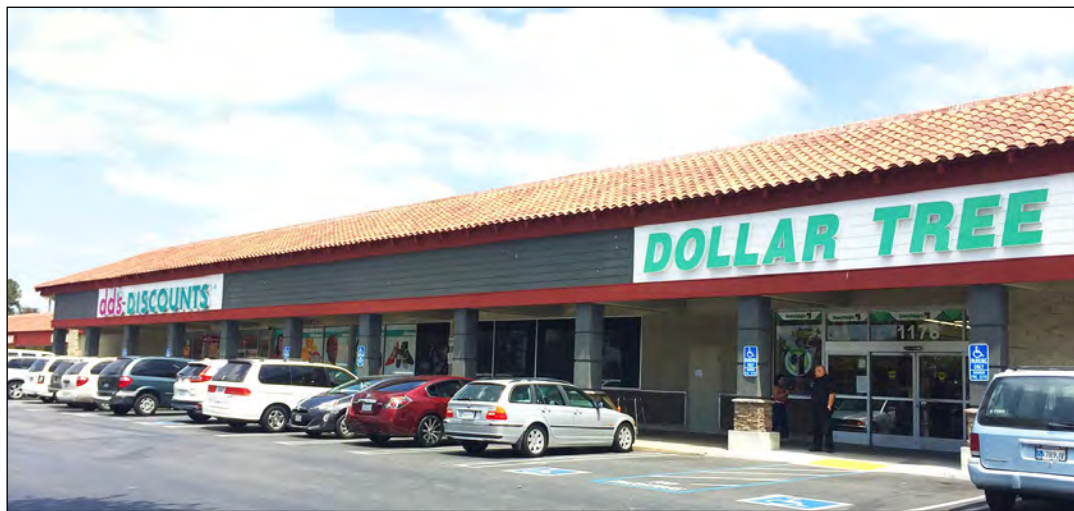
Building "B" Anchors dd's discounts and Dollar Tree