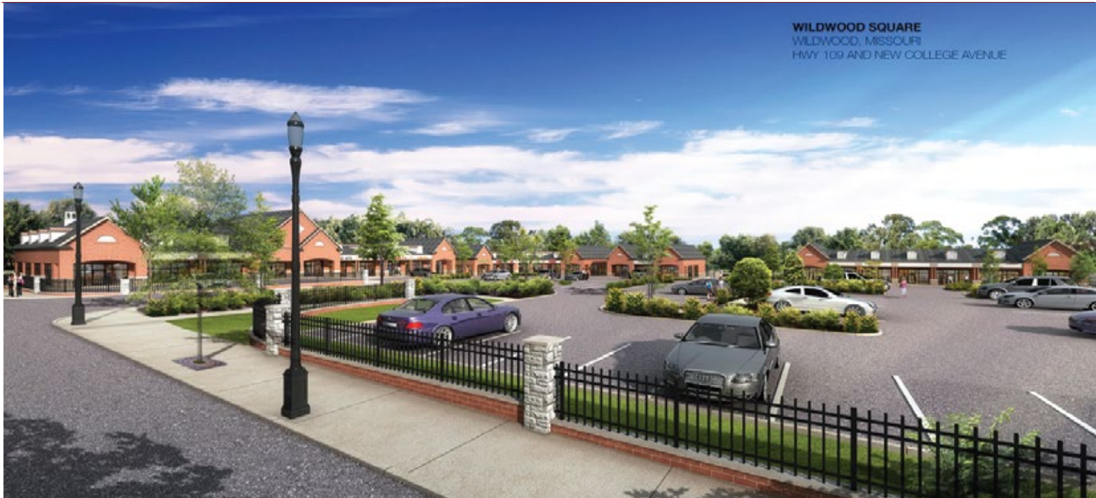
WILDWOOD SQUARE WILDWOOD, MISSOURI HWY 109 AND NEW COLLEGE AVENUE