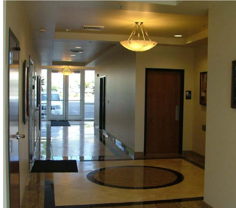
Class A Finishes in Lobby

6575 South Redwood Road, Taylorsville, Utah 84084