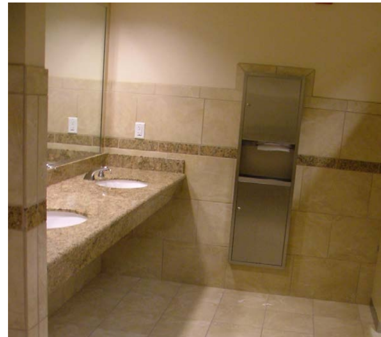
Top of the Line Finishes in the Restrooms