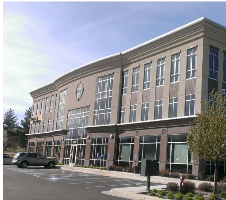
Top Floor Space With Amazing Views