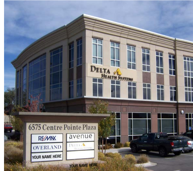
Built in 2008