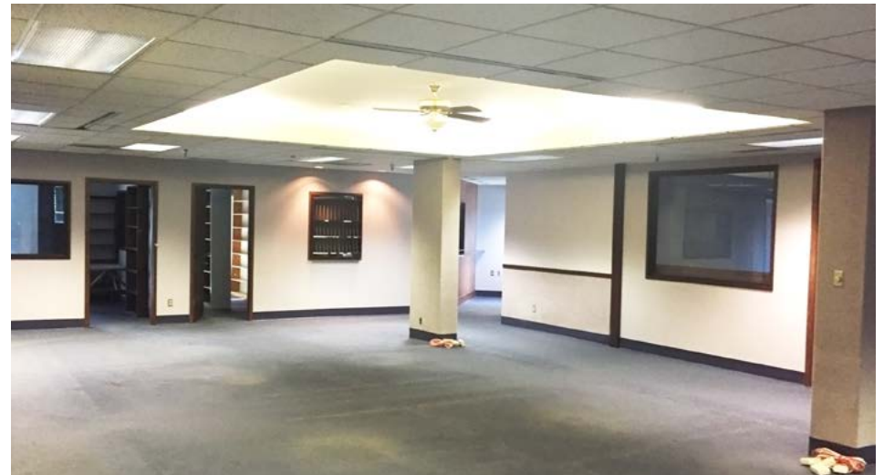
Suite 201 B – 3,500 SF