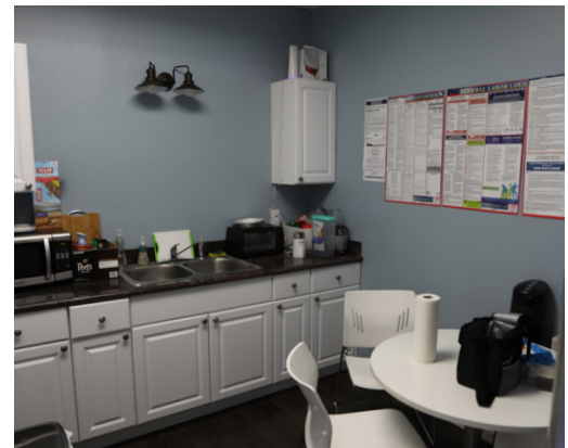
(Sample Build Standard Interiors)