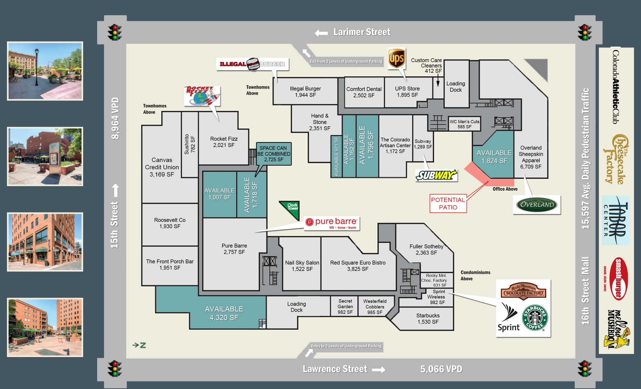
971 SF to 4,320 SF Available Call for pricing