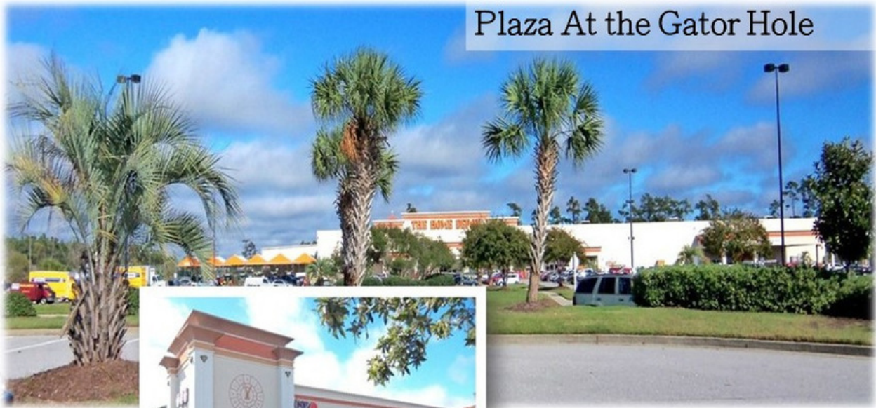
Plaza At the Gator Hole