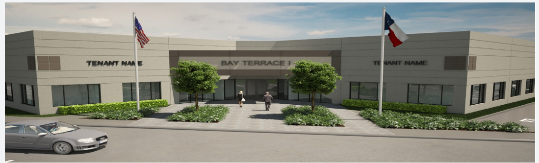
CORNER ENTRY VIEW