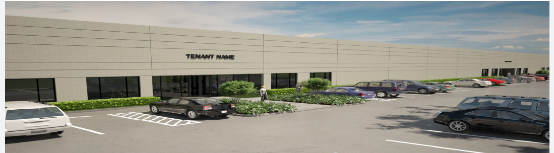
SIDE ENTRY VIEW