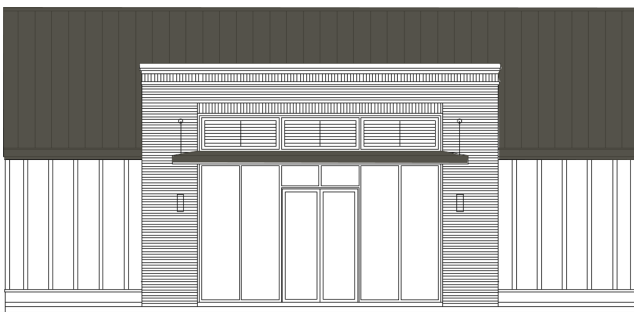
FRONT EXTERIOR ELEVATION