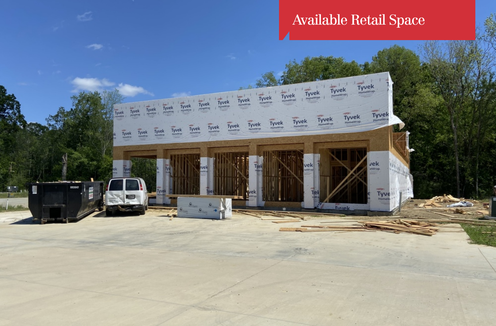
4,500 SF UNDER CONSTRUCTION (FALL 2020 DELIVERY)