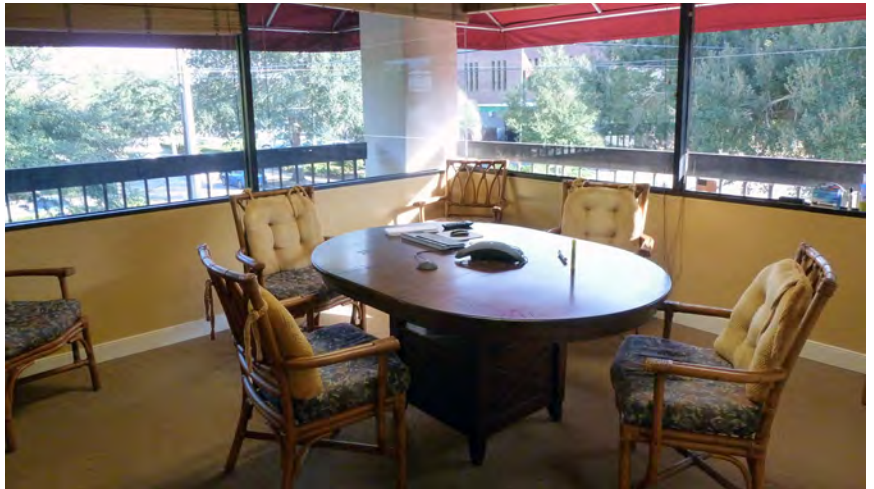
2nd Floor 6,301 SF