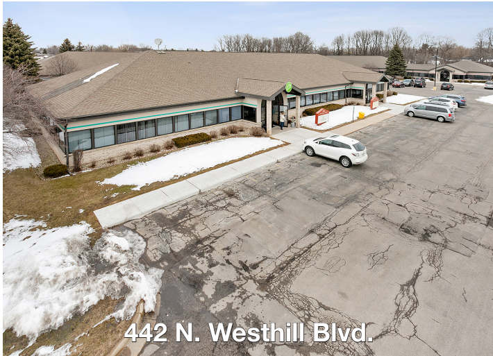
442 N. Westhill Blvd.