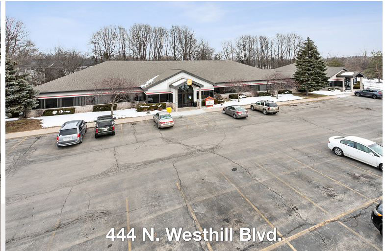
444 N. Westhill Blvd.