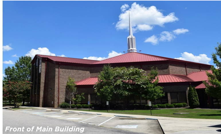
Front of Main Building

2545 Valleydale Road Birmingham, AL 35244 Unincorporated Shelby County