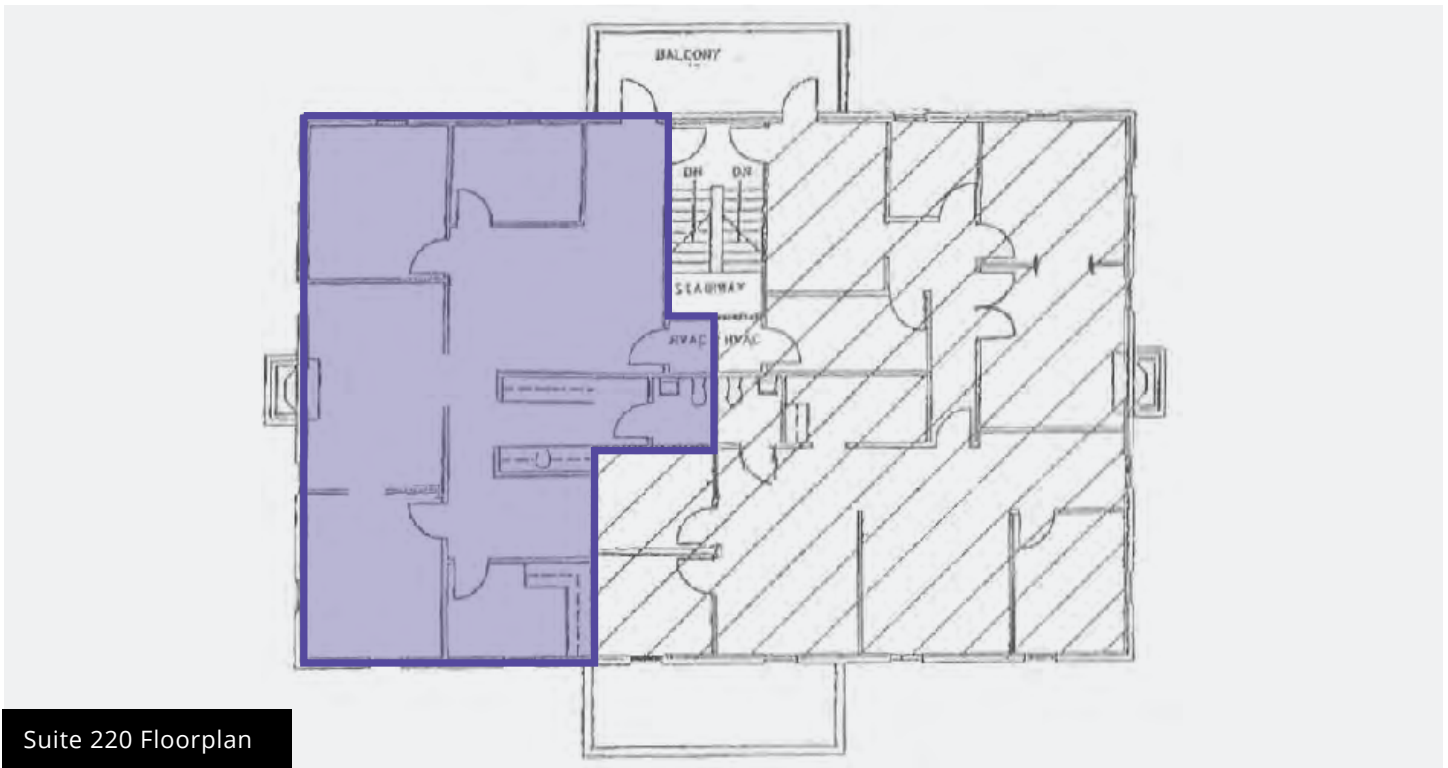
Suite 220 Floorplan