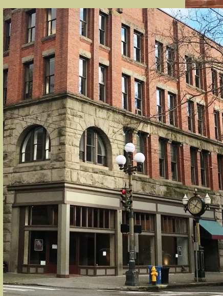
"Brick walls, wood floors, conference room, create a great work space"